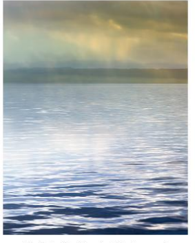
"Soft Reflection" - Photograph