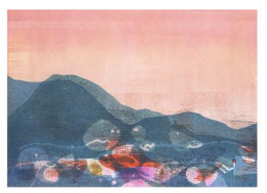
"Ocean" - monotype

"I am a transplant, and made my way west from Long Island, NY. I eventually planted roots in Seattle and Bainbridge Island. I left everything I'd ever known in search of something new and landed among mountains and lush evergreens. I guess you could say nature grew on me and quickly found its way into my heart and dreams. Nature is a prominent theme in my photography and printmaking. Abstraction and distortion allow me to communicate emotions evoked by dreaming, both asleep and awake. Asleep, I often dream of maps and undiscovered places, seeming just out of reach and anticipating arrival.